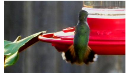
Rufous Hummingbird spreads tail at home 8-21 to 9-1, By Eric Haskell

Our neighborhood had its first female/juv. Rufous Hummingbird from 8/28 to 9/1, with Upland Sandpipers still stopping in nearby open fields.