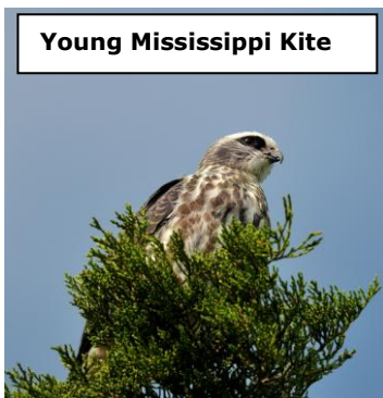
Young Mississippi Kite